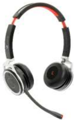
VT9605 BT Duo