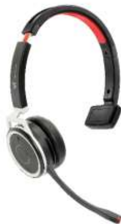
VT9605 BT Mono